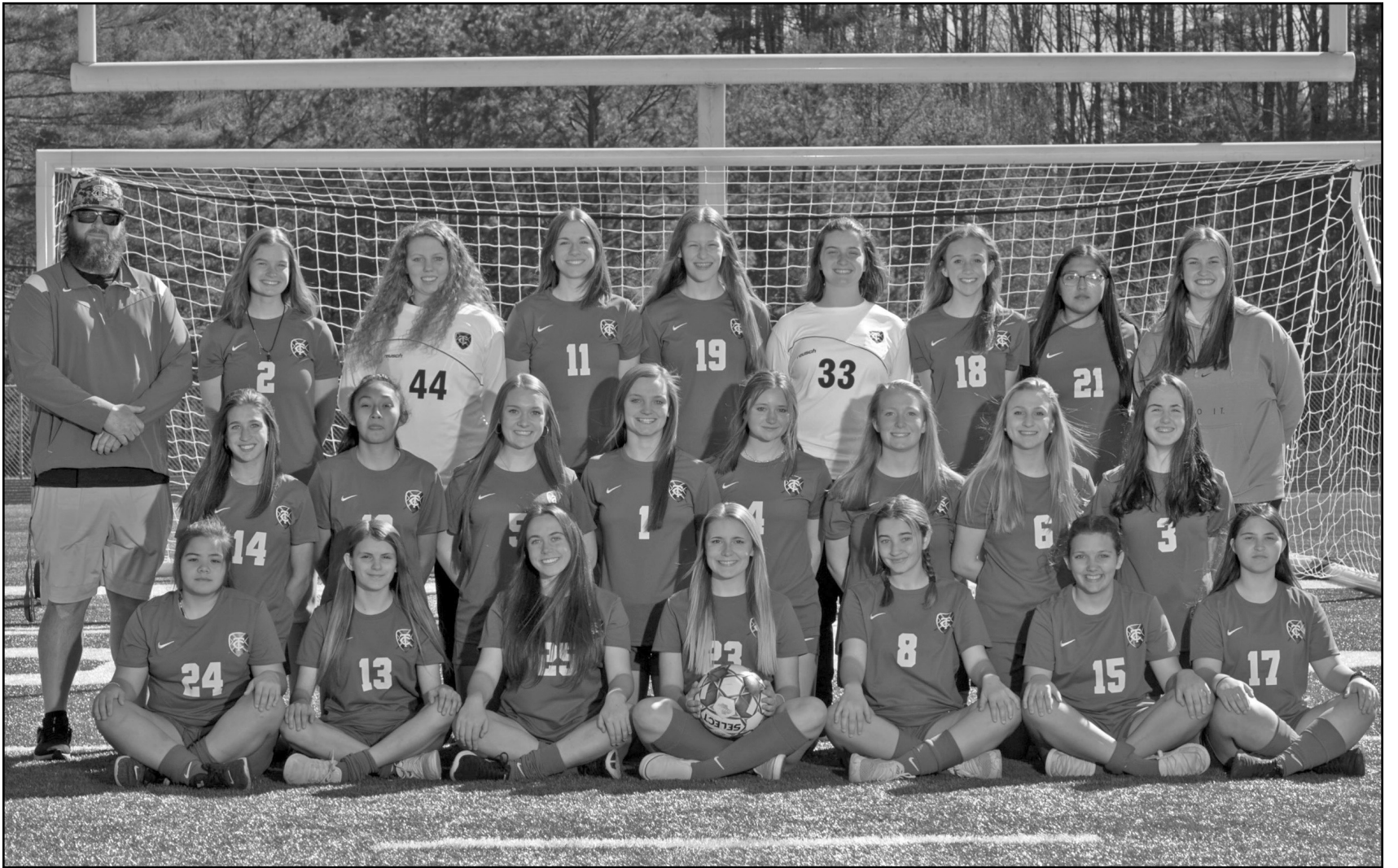
The Towns County Lady Indians begin postseason play on Tuesday with a trip to Rome's Armuchee High School.

"But ultimately, we choose not to put any focus or attention on the ranking, stats or numbers that we have. We believe that it cannot be our main drive, because there are never any guarantees, and